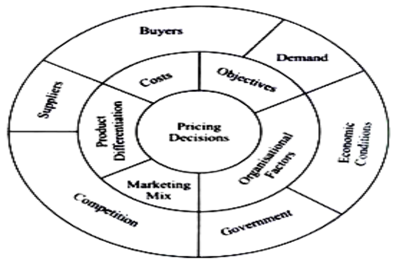
Factors Affecting Pricing Decisions

The influencing factors for a price decision can be divided into two groups: