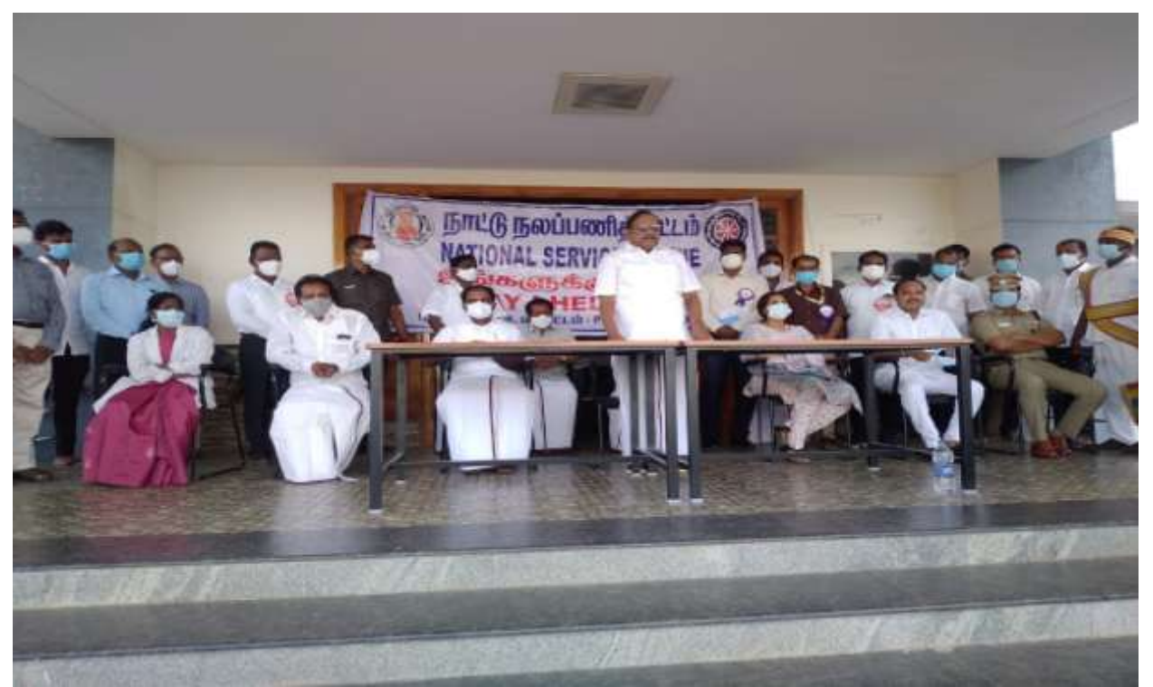
Minister of Law, Government of Tamil Nadu, addressing the function