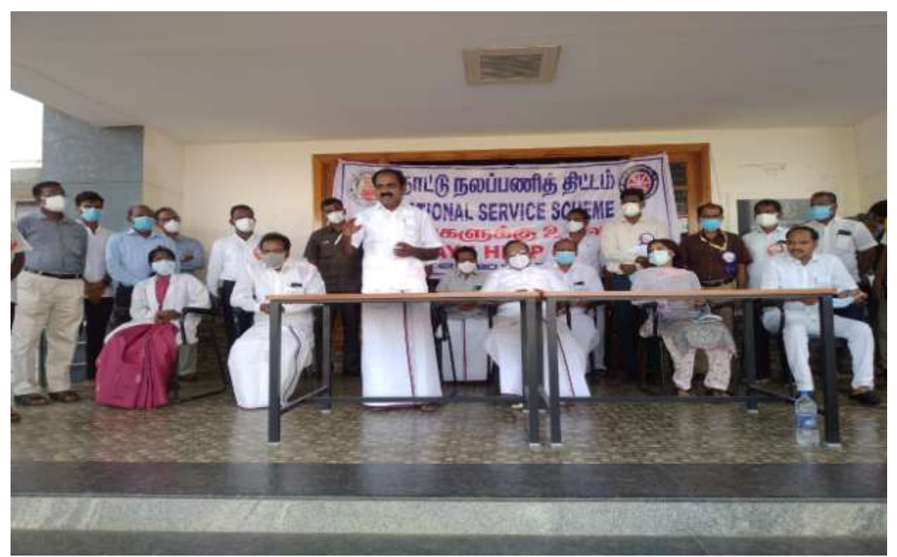
Minister of Environment, Government of Tamil Nadu addressing the function